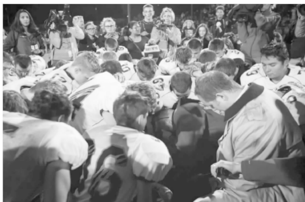
Photograph of J. Kennedy in prayer circle (Oct. 16, 2015).