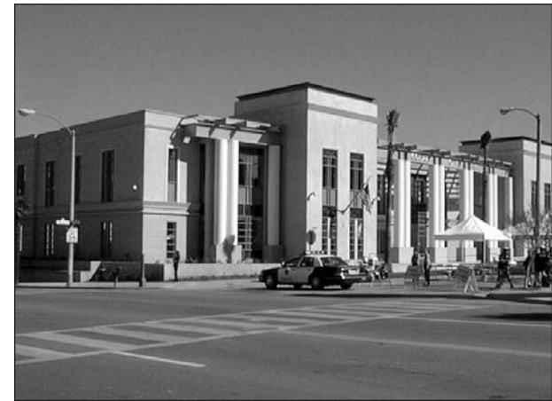
Exterior view of the court facility for the Court of Appeal, Fourth Appellate District, Division Two, in Riverside, California.