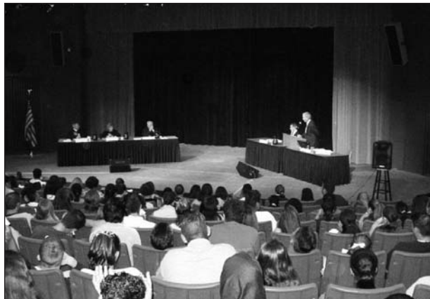
In September 2002 the Third Appellate District of the Court of Appeal held proceedings at a high school in Stockton, giving students a firsthand look at the appellate process.

It is customary for justices to interrupt an argument at any time to ask the attorney to address a specific point. The justices ask such questions to clarify issues of concern as they consider how to decide a case.