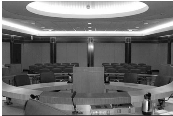
View of the courtroom for the Court of Appeal, Sixth Appellate District, in San Jose, California.